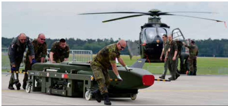
■ FOR SALE: Members of the German Armed Forces Bundeswehr carry a “Taurus” cruise missile at the International Aerospace Exhibition in Schoenefeld, Germany (May 30, 2016).