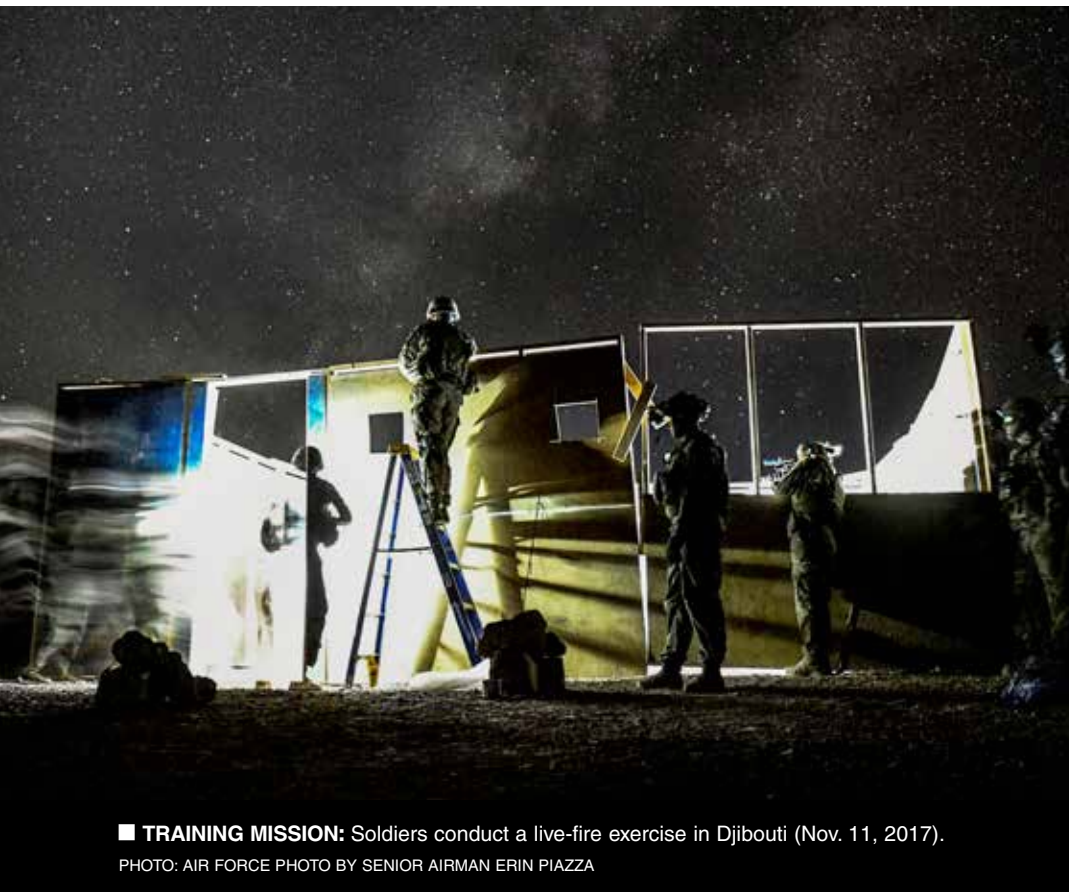
■ TRAINING MISSION: Soldiers conduct a live-fire exercise in Djibouti (Nov. 11, 2017).

And that is not to mention the refugee crises resulting from religious and ethnic wars across the Middle East and Southeast Asia, deadlier storms across the Caribbean and United States, and violent unrest rattling South America—that seem to jump from the headlines—all requiring greater and greater amounts of money and resources to overcome. □