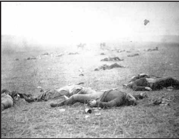
July 1863, Gettysburg: Aftermath of one of the most horrific and deadly battles of the American Civil War.