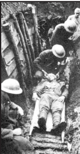
March 22, 1918: Marine receives first aid before being sent to hospital at rear of trenches.