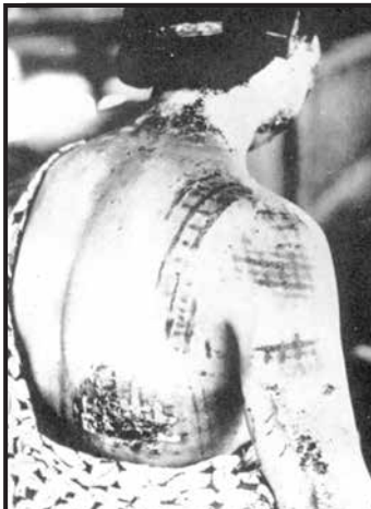
Aug. 1945: An atomic bomb survivor suffers from having portions of her kimono burned into her skin.

SOURCES: National Archives and Records Administration; U.S. Army; American Memory ( http://memory.loc.gov )