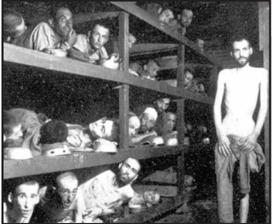
April 16, 1945, Germany: Slave laborers in the Buchenwald concentration camp.