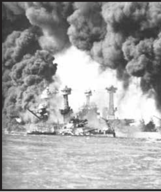
Dec. 7, 1941, Pearl Harbor: The U.S.S. West Virginia and U.S.S. Tennessee burn after the Japanese sneak attack.