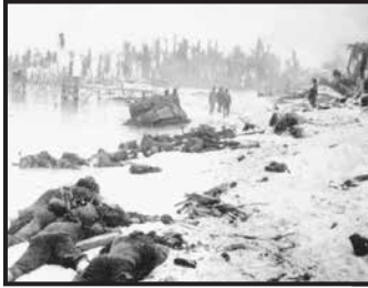
Nov. 1943, South Pacific: Bodies of dead soldiers are sprawled along the beach of Tarawa.