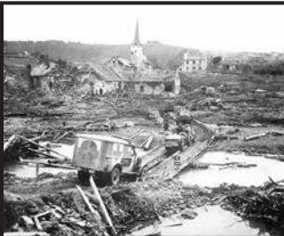
March 1945: Lunebach, Germany.