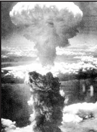
Aug. 8, 1945, Nagasaki, Japan: The second atomic bomb ever used in warfare is dropped.