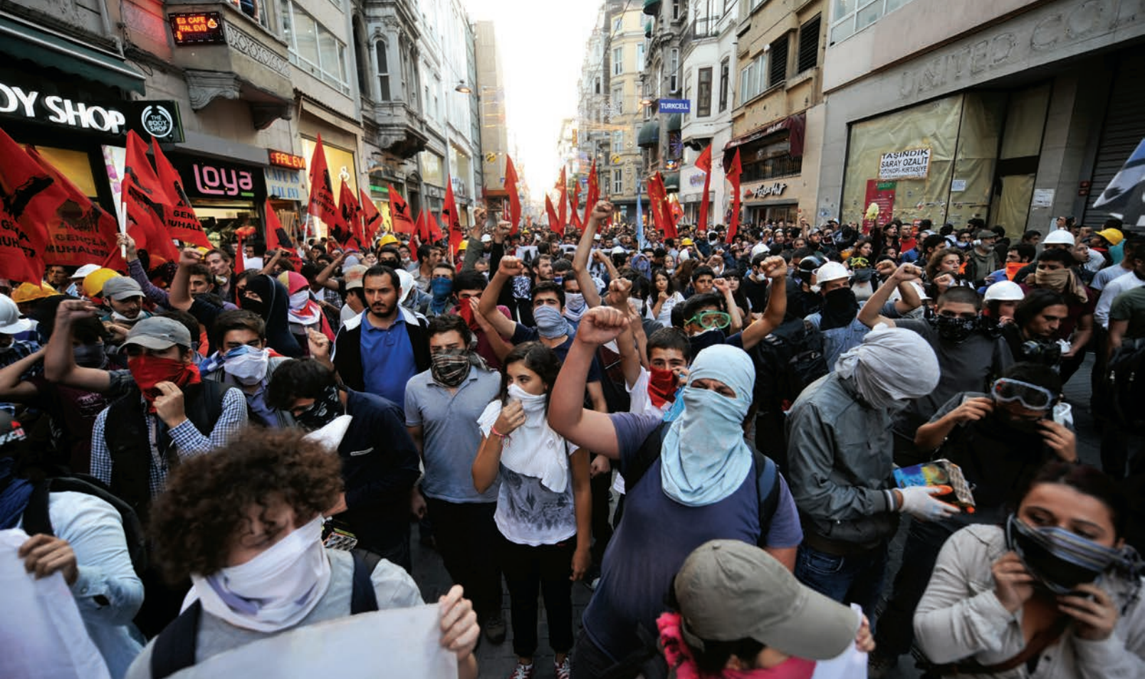
■ STORMING THE STREETS: Turkish protesters shout slogans while marching to Taksim Square in Istanbul just before clashes with police (Sept. 10, 2013).