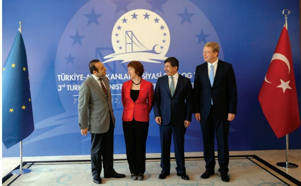
■ STANDING TOGETHER: From left to right, Turkey’s Minister for EU Affairs Egemen Bagis, EU High Representative of the Union for Foreign Affairs and Security Policy Catherine Ashton, Turkish Foreign Minister Ahmet Davutoglu, and EU Enlargement Commissioner Stefan Fuele pose for a photo during the third Turkey-EU Ministerial Political Dialogue Meeting in Istanbul (June 7, 2012).

A forum sponsored by Pew Research explored this point. Bernard Lewis, professor emeritus