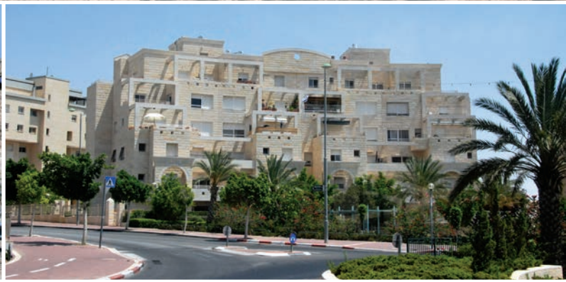
■ UNFINISHED SETTLEMENTS: Various views of the area in and around the city of Ma'ale Adumim can be seen in these photographs. The settlement is home to fully furnished buildings and construction sites that have been sitting dormant for years after the Israeli government stopped work in the area.