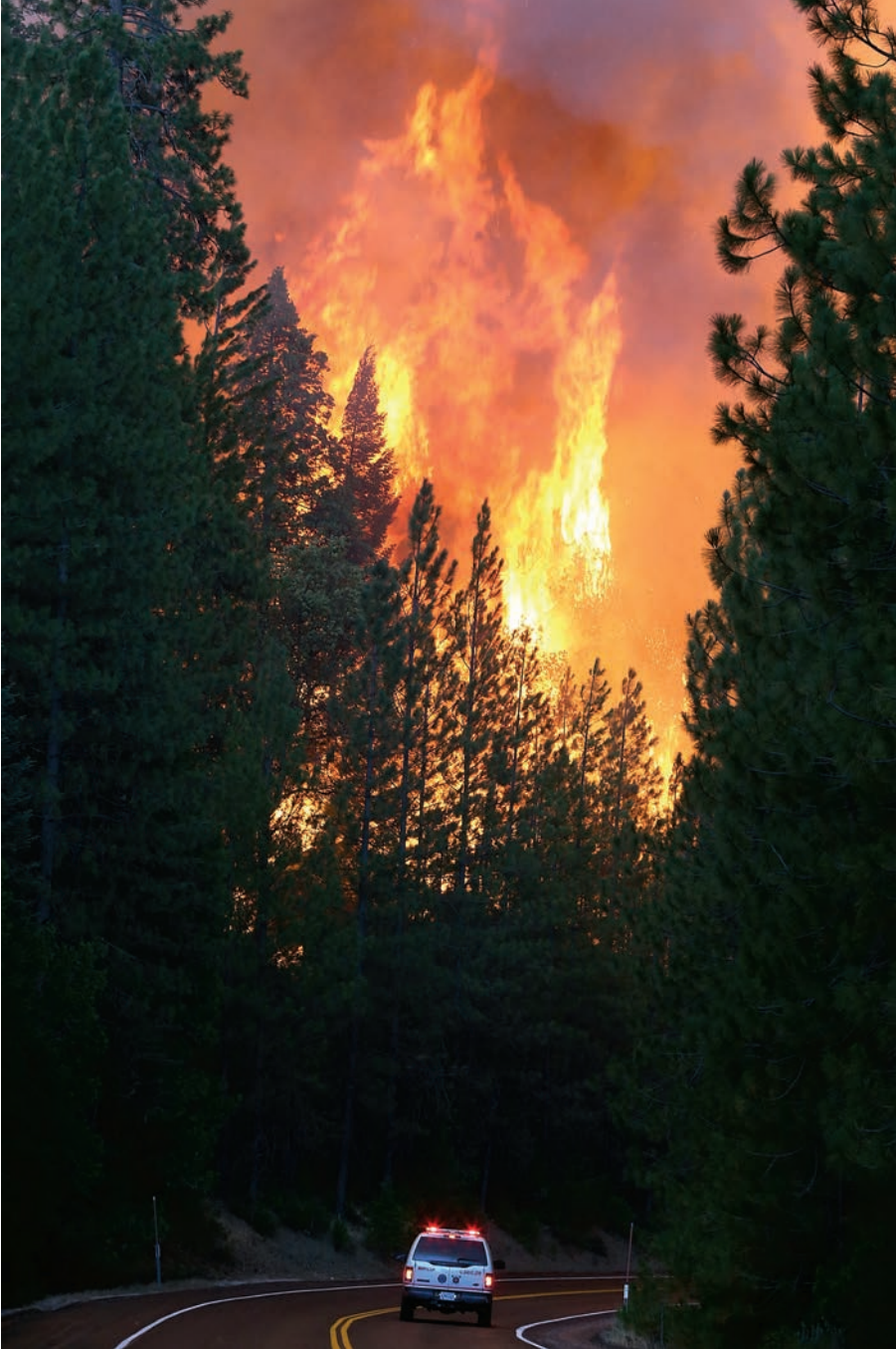
■ INFERNO: A Murphys Fire District firefighter stops his vehicle as a massive wall of flames from the Rim Fire consumes trees along a highway near Groveland, California (Aug. 24, 2013).

According to the research cited by ScienceDaily , "Large wildfires are mainly driven by natural factors including the availability of fuel (vegetation), precipitation, wind and the location of lightning strikes. In particular, the researchers found that exceptionally dry and unstable conditions in the earth's lower atmosphere will continue contributing to 'erratic and extreme fire behavior.'" □