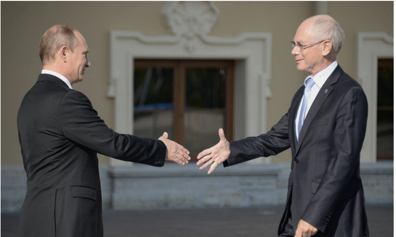
■ MEET AND GREET: Russian President Vladimir Putin, left, extends his hand to European Council President Herman Van Rompuy during a G-20 summit in St. Petersburg, Russia (Sept. 5, 2013).