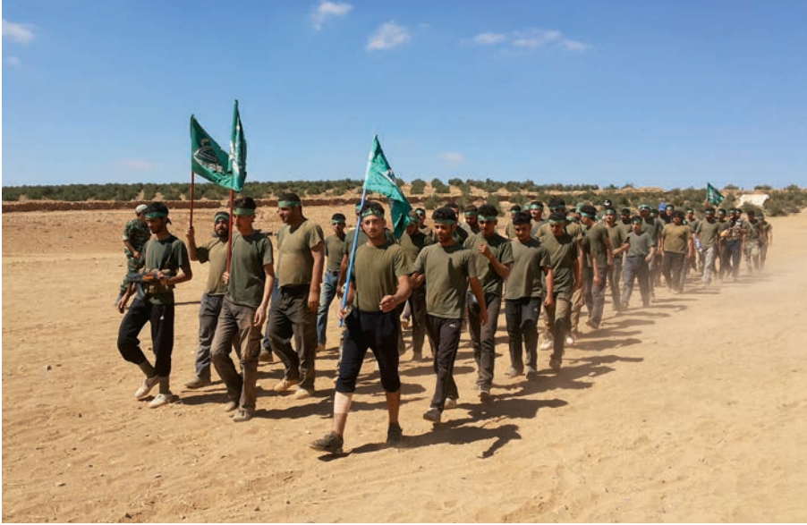
■ ON THE MARCH: Rebel fighters of the Yarmuk Brigade train on the outskirts of the southern Syrian city of Daraa (Sept. 29, 2013).